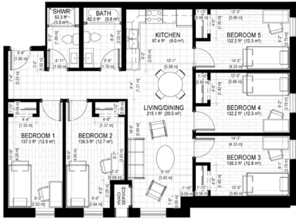
Suite 302 / 1208ft 2 (112m 2 )*