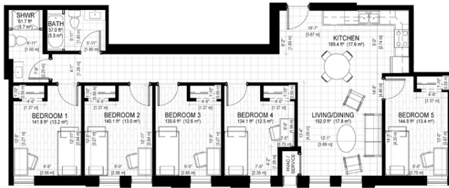
Suite 201 / 1272ft 2 (118m 2 )*

*GROSS FLOOR AREA (AS PER TARION BULLETIN 22)